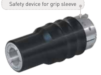
TK22 CNG with safety device for grip sleeve

The type TK22 CNG can be used wherever the system is pressurized and vented at the fuelling station. Easy push-pull connection. The nozzle only has to be placed onto the receptacle and the clamping jaws close. Disconnection is effected by pulling back the grip sleeve.