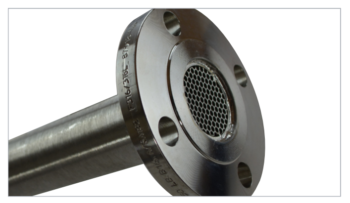
Built-in flow conditioning improves measurement accuracy in spaceconstrained applications.

This feature is of particular value in environmental monitoring applications, such as flares and vents, where periodic calibration validation is mandated. These tests help operators comply with environmental mandates and eliminates the cost and inconvenience of annual factory calibration. It can also be used to streamline quality assurance, improve process initiatives, and apply scheduled maintenance procedures.