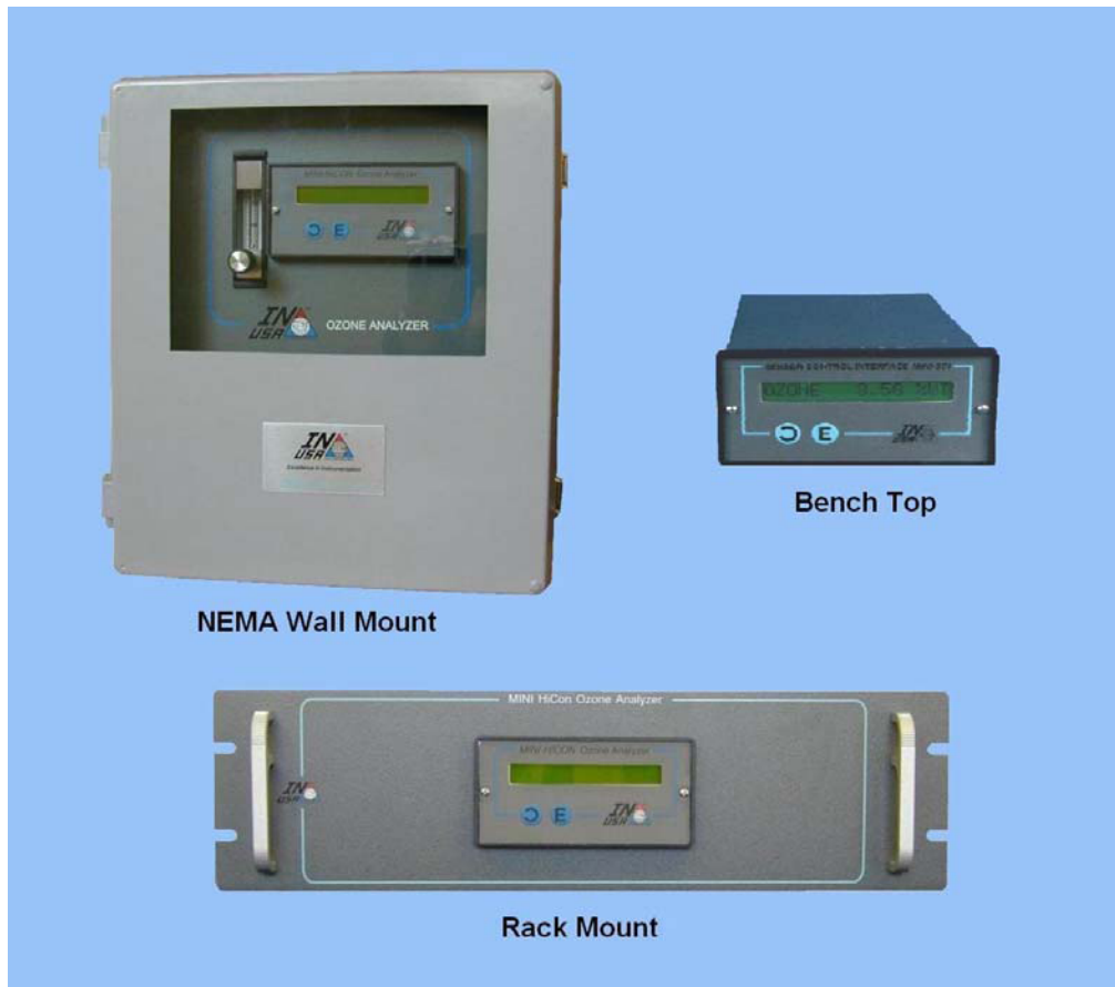
NEMA Wall Mount